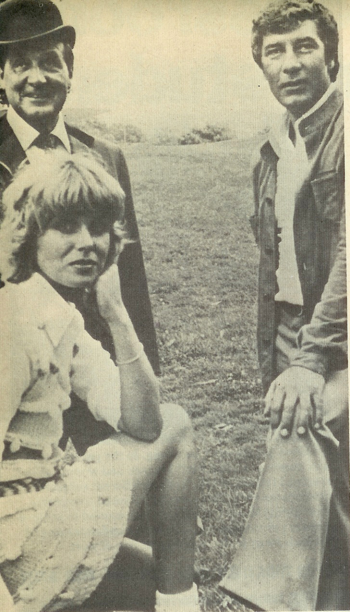
• ABOVE: Steed (Patrick Macnee) looks as dapper as ever in the new series, but Purdey (Joanna Lumley) and Gambit (Gareth Hunt) are in for some changes.