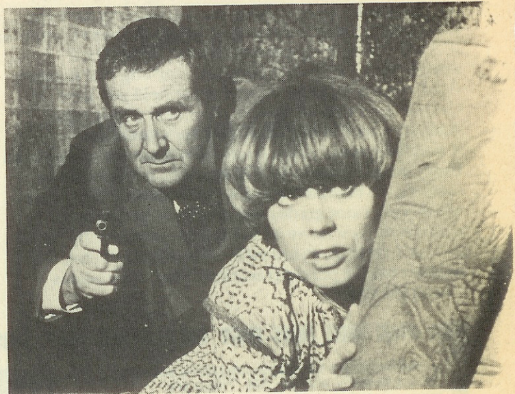
• ABOVE: Steed and Purdey take cover during a tense moment in The New Avengers , combating high-powered espionage and corruption.

THE NEW AVENGERS are in for some changes. But they won't alter the basic flavor of the series.